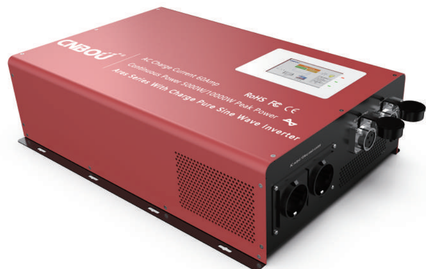
Ares Series * 3D model available